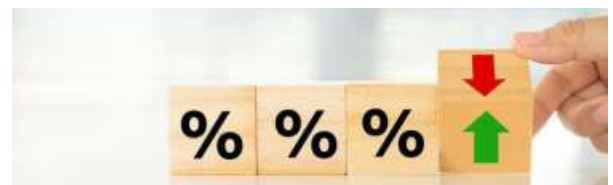
The weighted average lending rate on fresh rupee loans of banks rose 39 bps to 8.67% in January 2026 from 8.28% in December 2025

That the transmission of the repo rate cuts into lending rates may have concluded can be gauged from the fact that the weighted average lending rate (WALR) on fresh rupee loans of scheduled commercial banks (SCBs) rose 39 bps to 8.67 per cent in January from 8.28 per cent in December 2025. The WALR had declined by