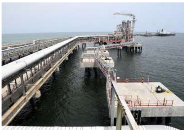
EXPLORING OPTIONS. A view of the IndianOil LNG terminal at Ennore in Chennai. India is also talking to the US, Australia and Canada for LNG supplies

Top government sources said that India is in touch with the International Energy Agency (IEA) and the OPEC on the West Asian scenario. It is also talking to the US, Australia and Canada for LNG supplies.